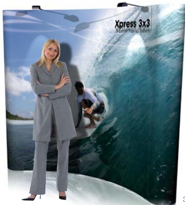
3x3 Pop Up Shown